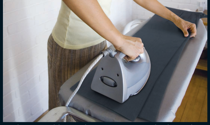
Reduce wrinkles and start tomorrow looking sharp