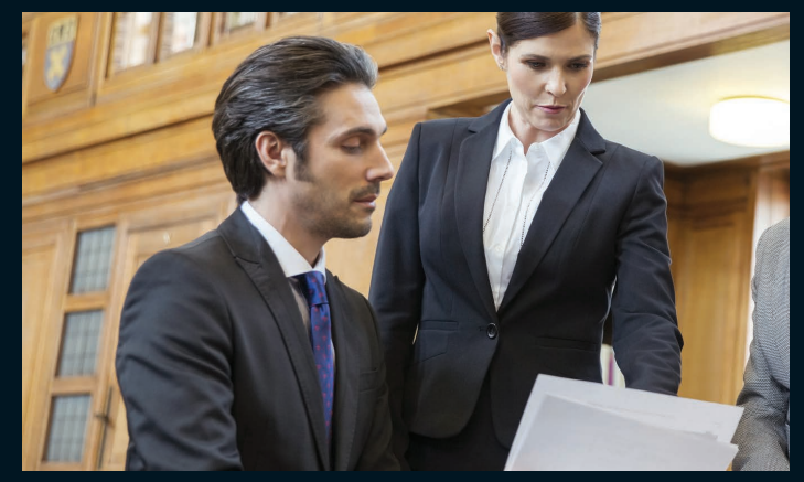
Trial prep includes looking prepared

Meetings go better when people look and feel their best. The LG Styler reduces wrinkles and odors and refreshes clothing so everyone stays sharp.