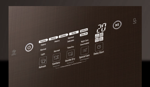
Hidden LED Display