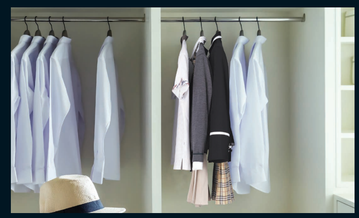
Keep uniforms looking fresh from the cleaner