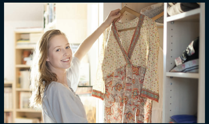
Refresh and remove odors before storing

The LG Styler makes a smart addition to any new home or home remodeling plans.