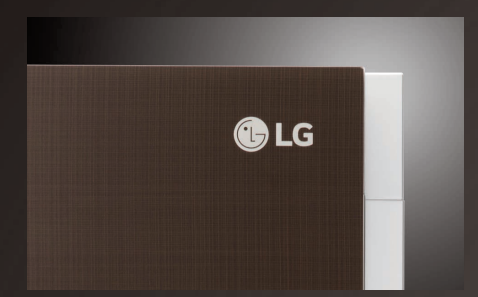
Anodized Aluminum Frame