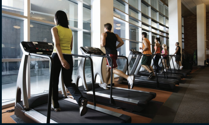
Reduce odors in sportswear