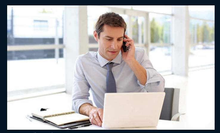
Never let them see you sweat