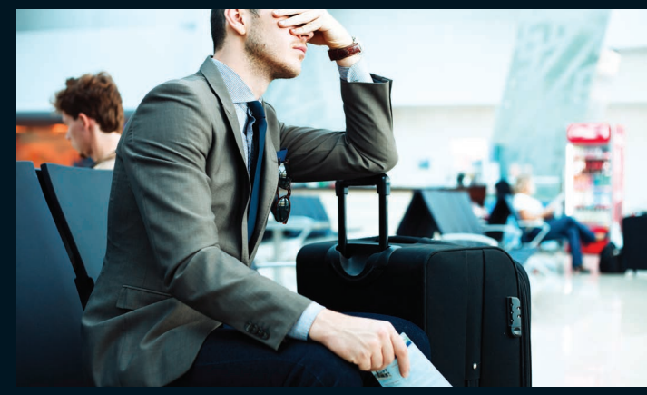
Long stopovers or delays

Visitors to the airport VIP lounge can refresh clothing while they wait to board or after deplaning. They will arrive at their destination with refreshed clothing.