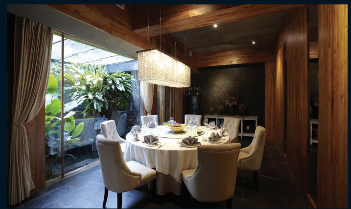
Clothes stay securely in the same room as guests