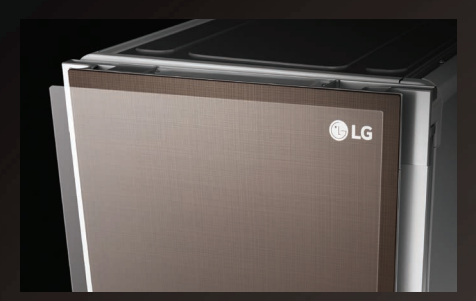
Glass Door with Linen Pattern