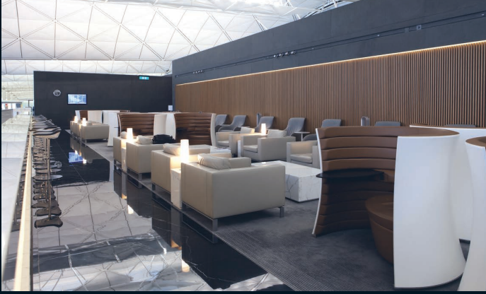
Special VIP lounge service