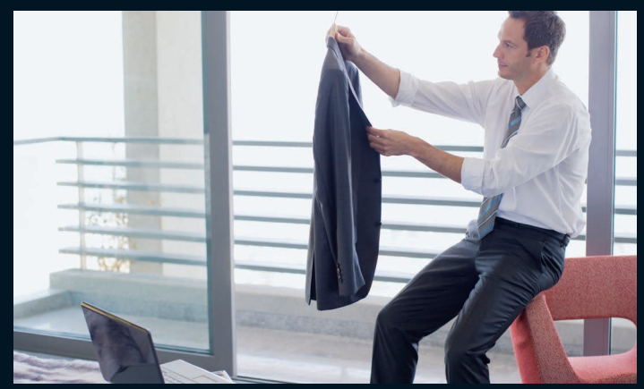
Prepare a suit for tomorrow's meeting

Guests can pack fewer clothes and travel light. The LG Styler refreshes or gently dries clothing, making it ready to wear again.