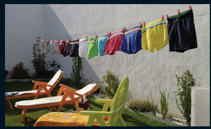
Gently dry swimsuits