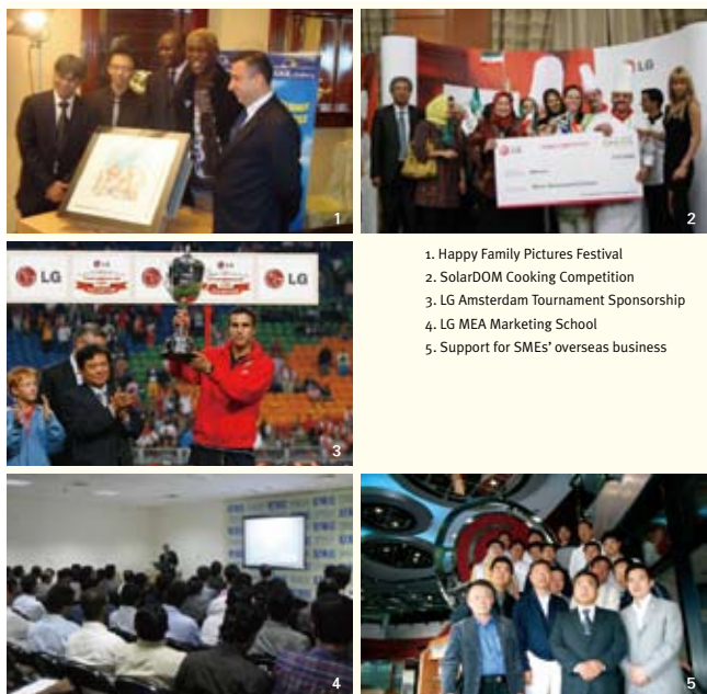
1. Happy Family Pictures Festival 2. SolarDOM Cooking Competition 3. LG Amsterdam Tournament Sponsorship 4. LG MEA Marketing School 5. Support for SMEs' overseas business

In November 2008, LGE hosted a workshop on the benchmarking of its success in Dubai and business in general in the Middle East for representatives of small and medium enterprises (SMEs). It plans to hold this workshop on a regular basis to support SMEs' overseas business and to lead win-win partnerships.