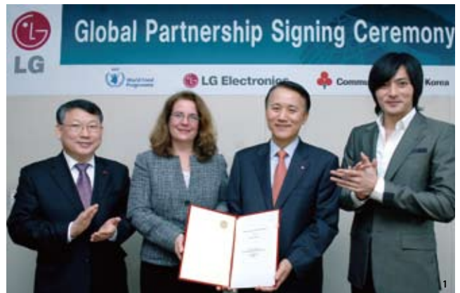
1. Signing Ceremony for MOU with WFP 2. Famine Alleviation (Kenya, Ethiopia)

Volunteer Activities by Business Sites • Each company and region is also participating in volunteer activities: sharing kimchi and coal in the winter with the financially disadvantaged and elderly men and women who live alone, helping keep people's homes warm, and donating blood. LG Electronics also maintains close ties with residents by holding charity bazaars aimed at developing local communities, as well as offering scholarships and giving out school uniforms to teen heads of households. In addition, LG Electronics is proud to offer industrial scholarships, promote its Guardian Angel Fund (for terminally ill children), and regularly invites disabled people to cultural performances.