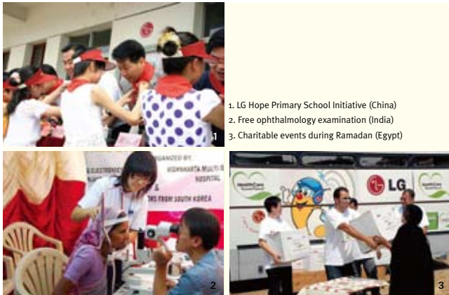
1. LG Hope Primary School Initiative (China) 2. Free ophthalmology examination (India) 3. Charitable events during Ramadan (Egypt)