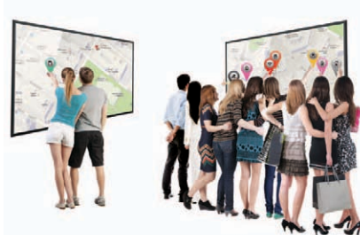
2 ~ 6 Point Competitor

Because there is no need for a separate pen, you can easily utilize it with the touch of your hands. It provides a more realistic sense of touch since it can sense 10 simultaneous touches at once.