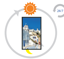
PD Module Structure