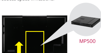
Hybrid Type Media Player

Compatible with MP500 player simplifies the cabling and reduces space limitations.