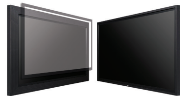
Competitor External Overlay