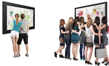
2 - 6 Point Competitor

Can be used in various high-traffic locations such as subway and exhibition halls for interactive way-finding and informational purposes with our improved 10 points touch monitors.