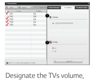
to turn EzSign on/off, display an instant message, and other items to play