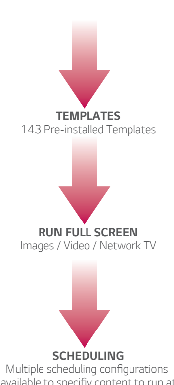
available to specifiy content to run at designated times/ days