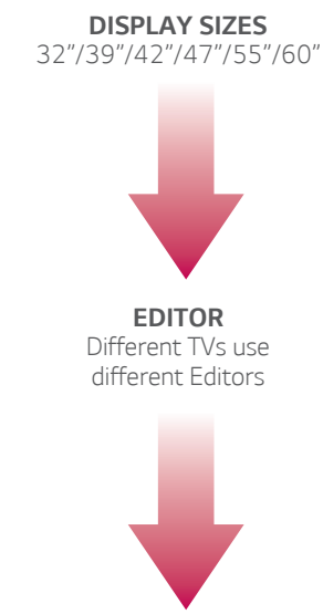
STAND ALONE Export content to USB using EzSign Editor