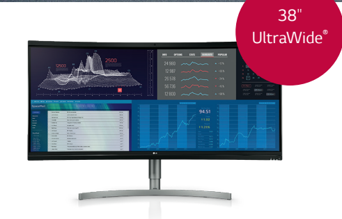
LG 38" AIO Curved UltraWide® Thin Client