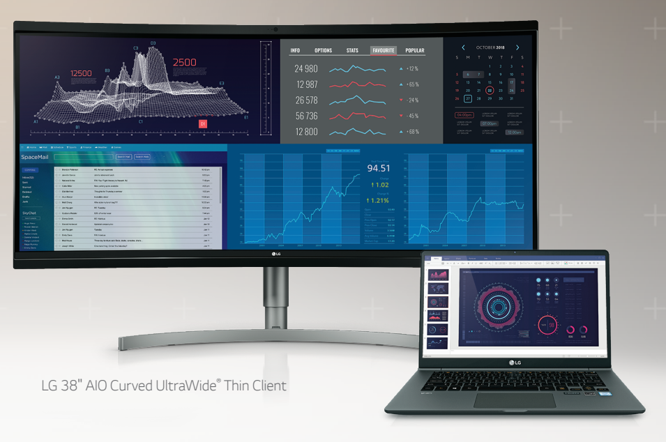
LG Mobile Thin Client

LG Thin Clients are designed for wherever security, manageability, and streamlined user experience are crucial factors for success. Whether deployed in data-heavy healthcare and finance contexts or cost-sensitive higher education settings, every LG Thin Client has inherent security to protect sensitive data and simplified management to minimize potential downtime.