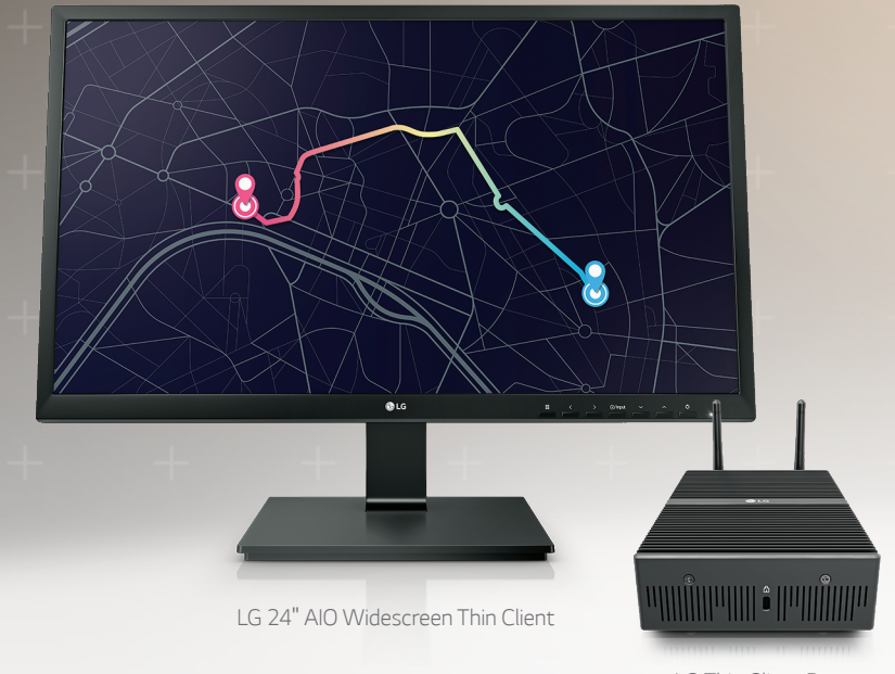
LG Thin Client Box