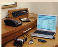
Multiple components can be connected all at once