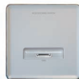
IDS-20G (iPod® Docking Station)