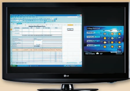
POP (Picture outside of Picture) can be used with TVs that have this feature