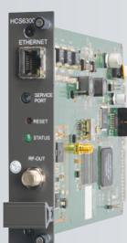
HCS6300 DIRECTV HCS6320 DISH Mod/Mux/Controller Card