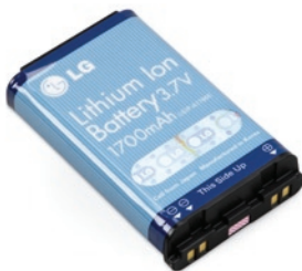
Extended Li-Ion Battery