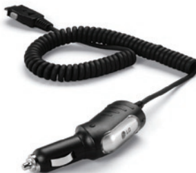
Vehicle Power Charger