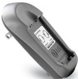
Battery Wall Charger

Accessories for productivity, convenience and fashion are available at www.LGUSA.com .