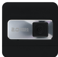
2.0 Megapixel Autofocus Camera & Camcorder