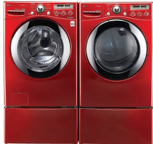
Wild Cherry Red

DLEX2450R Electric Dryer - Wild Cherry Red 048231 012218 DLGX2451R Gas Dryer - Wild Cherry Red 048231 012225 WDP4R Pedestal - Wild Cherry Red 048231 011204 RSTK1 Stacking Kit - Wild Cherry Red 048231 008983