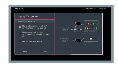
You can see the screen shown above to start the set up routine. There, select (A) to access the IR blaster settings.

Connect the Audio amplifier and other devices to the TV if necessary.