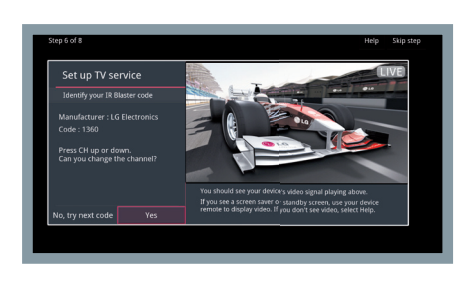
The TV will generate a test code to see if the remote is properly working with the cable/satellite box. Press the CH up and down to check the code. If the Channel doesn't change, then select [ No, try next code ] to repeat this step until you find right code.