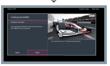
Your channels are analyzed. If it is finished successfully. Select [ Next ].

The TV will generate a list of premium channels. Select [Yes] if you receive any of these channels.