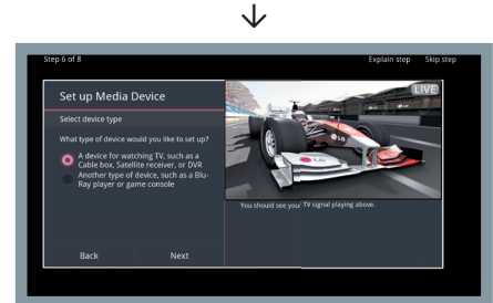
Select your connected device type.