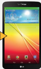
Owner Mode Unlock