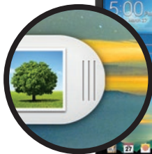
Recent App. Sticker

*Apps opened with the shortcut must be installed on both the phone and tablet.