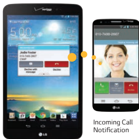
Incoming Call Notification

Receive alerts when your smartphone gets a call or message—you can see the caller ID, reply to messages, and view social network updates on the Status Bar.