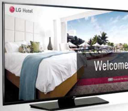
LX341C : 43"/49"/55"/60"/65"