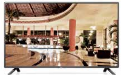
LX330C : 32H"/42"