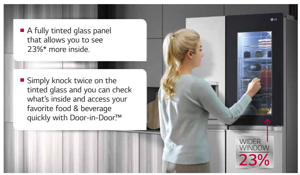
*Compared to LG conventional Side-by-Side InstaView Door-in-Door™