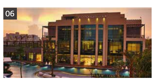
Apartment & Club, Gurgaon (690 HP)

* Actual building appearance may differ from the above simulated scene.