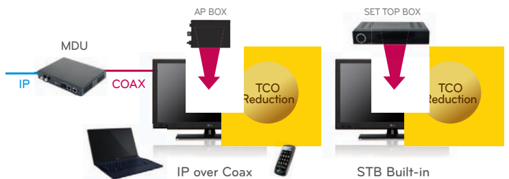
IP over Coax

Save big on the expenses of managing the Hotel TVs with LG's unique STB integrated solution and IP over Coax.