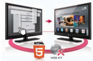
Customizable UI_Web Kit & HTML5

LG Pro:Centric Smart offers all the customizable tools that our partner can optimize Hotel TVs with IP-based programs; Web-kit and HTML5.