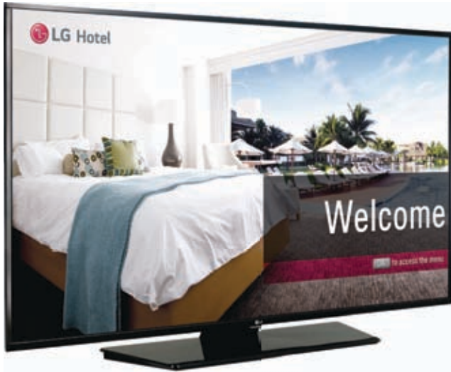
LX341C : 49" 55" 60"

LG Commercial Lite TVs are designed specifically for hospitality and business environments. With the use of simple user-friendly interfaces and superb images and video, the LX341C series create a more hospitable welcome for guests and customers.