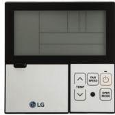
Standard II PREMTBB01