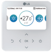
Standard III PREMTB100