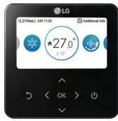
Standard III PREMTBB10