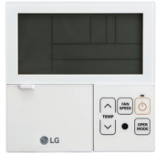
Standard II PREMTB001