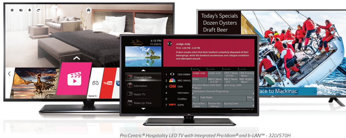
Pro:Centric® Hospitality LED TV with Integrated Pro:Idiom® and b-LAN™ - 32LV570H