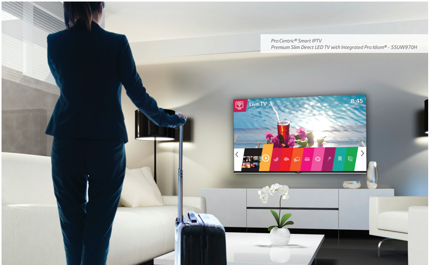
Pro:Centric® Smart IPTV Premium Slim Direct LED TV with Integrated Pro:Idiom® - 55UW970H

YouTube, and offer the IP-based integration needed to deploy customized services without the need for a set-top box. Our wide platform support of HTML5, Java and Flash allows more options for systems integrators to develop rich, interactive custom applications guests will appreciate. And with built-in Wi-Fi and display sharing, your guests will be securely connected to enjoy personal content from their compatible mobile devices on their room TV.