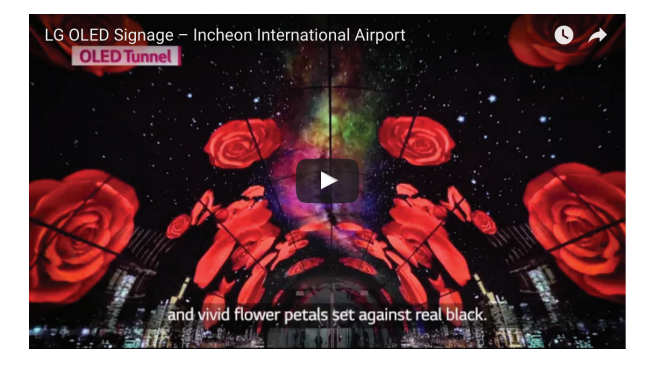
See LG OLED in action at Korea's Incheon International Airport and N Seoul Tower.