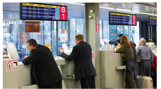
86" Ultra Stretch Display - 86BH5C

Outdoor digital signage can assist and guide passengers from the moment they arrive at the airport. Because the signage will be competing with direct sunlight, bright daylight and the elements, you should select high-brightness displays rated for outdoor use, with remote management capability for content updates via the network. LG's 55- and 75-inch high-brightness displays are IP-56 rated to withstand temperature extremes and humidity while fending off damage from dust, dirt and other airborne particulates.