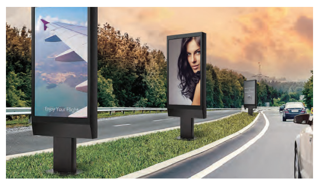
Enclosed Outdoor Signage - 75XE3C