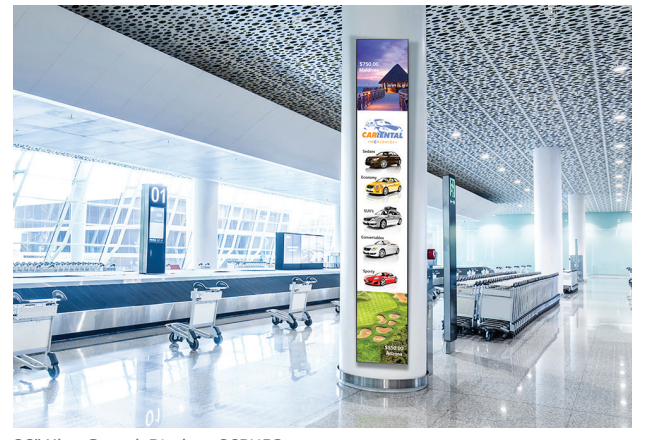
86" Ultra Stretch Display - 86BH5C

Combining other messaging with the flight information data in the gate hold areas can enable cross-optimization. Display public announcements, special offers for the coffee bar in case of a delay, a travel umbrella sale at one of the shops if the destination weather calls for rain, or alert notifications in case of emergency.