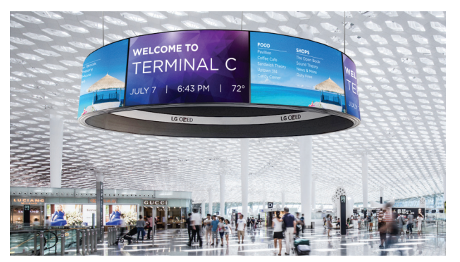
LG OLED Curved Display - 55EF5C

Placing a display near the TSA line and showing illustrations and animations to remind people to empty their pockets, or other instructions, will help eliminate communication barriers and speed the screening process. LG offers a variety of display sizes and formats to accommodate virtually any space and ensure the messaging will be clearly seen.