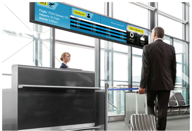
88" Ultra Stretch Display - 88BH7D

For the shops and food courts, LG offers a wide range of displays from 22-inches to 98-inches. Look for displays specified for 16-24-hour / 7-day operation, with webOS<sup>TM</sup> software, beacon technology, embedded PCs and energy-efficient operation. These displays offer a high return on investment with a low total cost of ownership. Vendors can display special promotions to people in their store using beacons and near-field communication (NFC) technologies. Digital menu boards will allow restaurants to automatically change menus during the day via software for daypart scheduling.