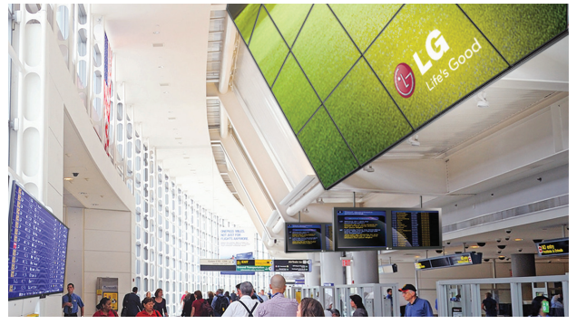
LG Video Wall - 55VH7B

Displaying flight updates and general information at the check-in counters will help passenger foot traffic flow smoothly. Look for displays rated for 24/7 operation, with automatic screen fault detection which sends email alerts in case of screen failure. Additional features should include image sticking minimization to prevent image retention; and PC-less content management.