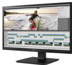
24" Widescreen AIO Thin Client (24CK550W)