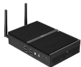
Thin Client Box (CK500W)