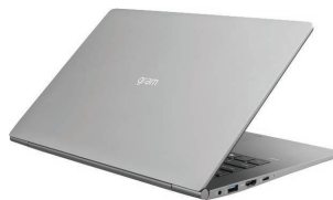
Mobile Laptop Thin Client (14ZT980)