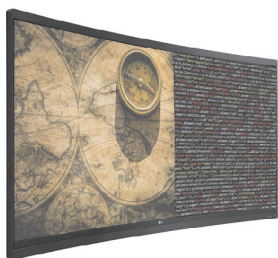
38" Curved UltraWide AIO Thin Client (38CK950N)

The LG CK500W Thin Client Box includes 4GB DDR4 (up to 8GB), 32GB SSD, dual-monitor capability, multiple ports and connectivity options, and Windows 10 IoT Enterprise in a space-saving, fanless design.