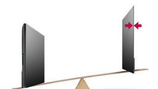
LCD 86.5 mm 18.6 kg

Slim and light With just two layers, the LG OLED Signage display is unbelievably lightweight and thin.