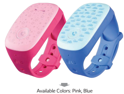
Available Colors: Pink, Blue